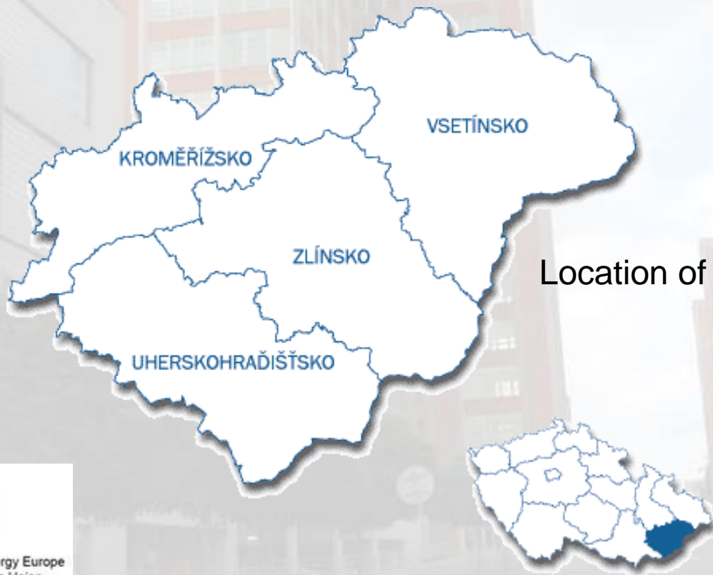
Location of the Zlín Region within the CR