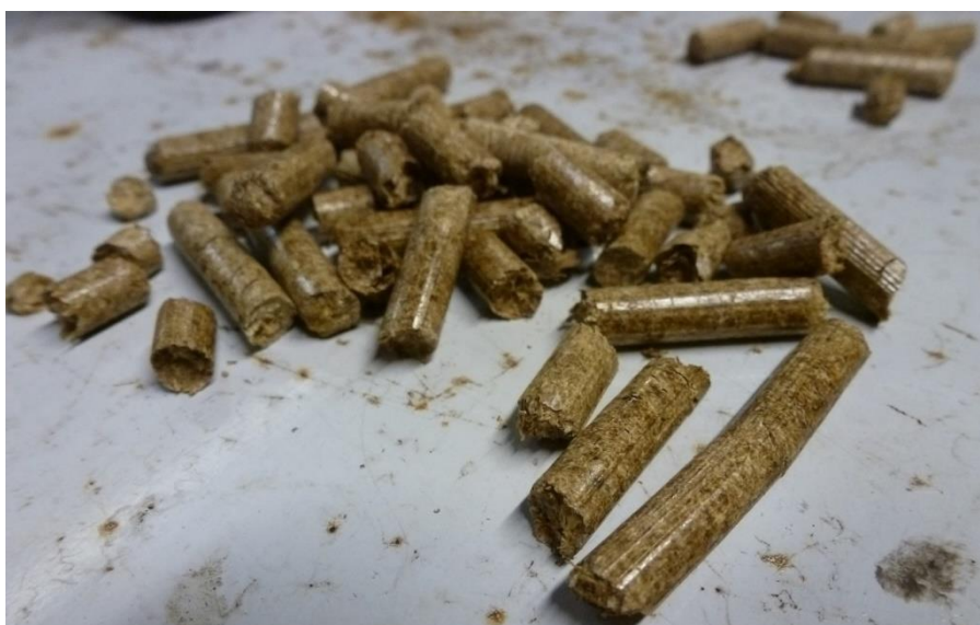
Figure 2: Pellets aspect (test n°3) (Scale: 100 mm = 80 mm)

Test N°3 : the third sample pelletized was with no additive, 2% water added, press n°1 compression 34 (See ¡Error! No se encuentra el origen de la referencia.)