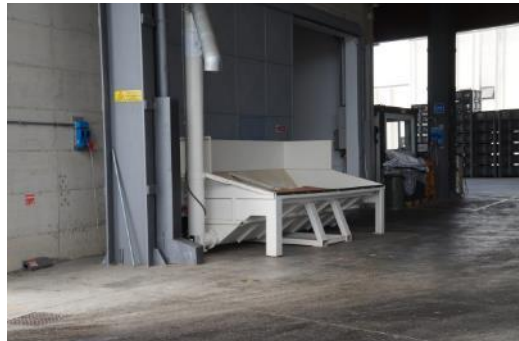
Figure 4 : OL.MA. facilities: the olive pomace storage, the transport cochlea for olive pomace to the loading area of the trucks, olive pits boiler, olive pits storage.