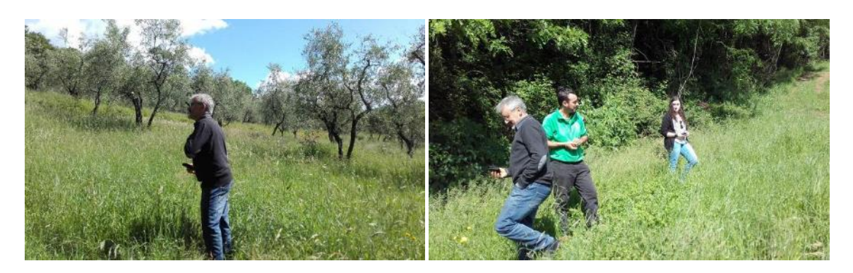
Figure 2: Meeting with ONG snc in the area of Azienda Agricola II Bello

The manufacturer showed agro-pruning chips processed by his chipper. He explained that the equipment can cut prunings with different sizes, adjusting the distance between blades. Despite this, he suggested to keep prunings as long as possible, to prevent rotting. In this regard, he showed also a breathable big bag used with the chipper, to facilitate the natural drying of the chips.