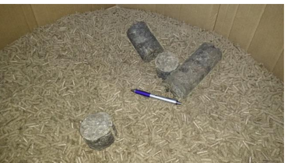
Figure 6: pellet and briquettes from vineyard pruning, produced by Costruzioni Nazzareno