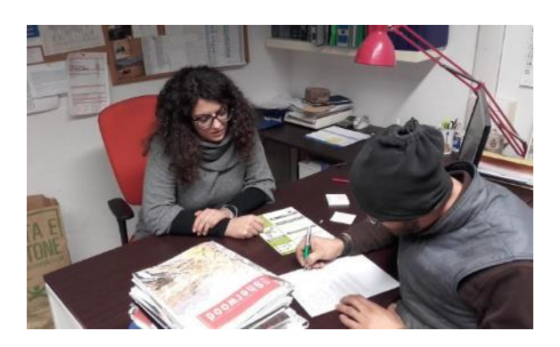
Figure 3: Meeting with potential supplier for Rapaccio company

olive tree pruning, they agreed to sign the letter of interest for the supply of pruning once the cost-benefit assessments will be clearer.