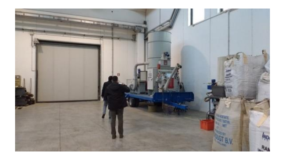
Figure 7: pelletizing line (movable-for field use) for agrarian pruning – Costruzioni Nazzareno